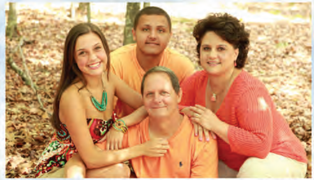
The James Family welcomes you to Mountain Lake!

Right across the road from our office, Tad's Smokin' BBQ serves up a mouth-watering menu of barbecue favorites, as well as delicious sides and desserts!